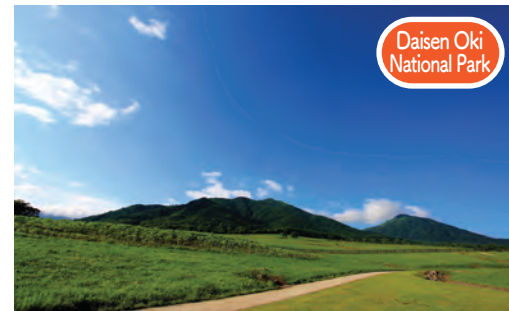
Daisen Oki National Park