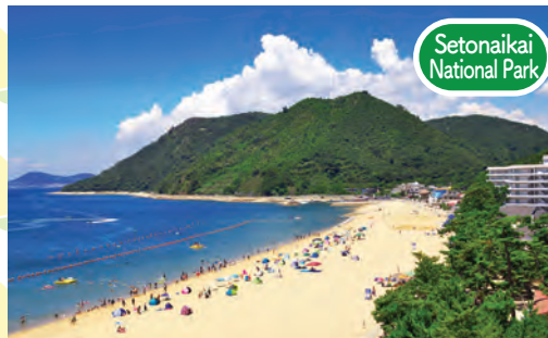
Setonaikai National Park