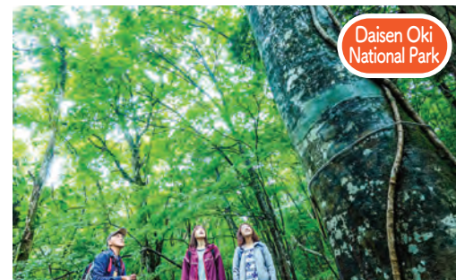
Daisen Oki National Park