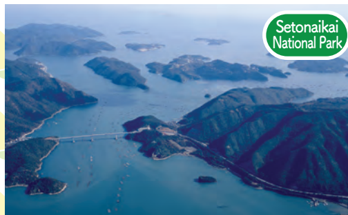
Setonaikai National Park