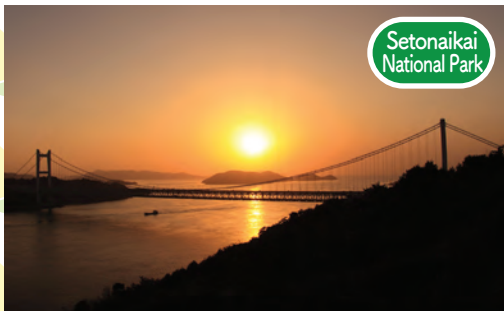
Setonaikai National Park