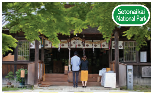
Setonaikai National Park