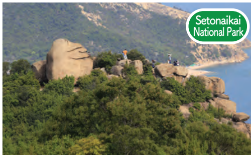
Setonaikai National Park