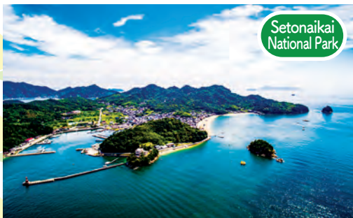
Setonaikai National Park