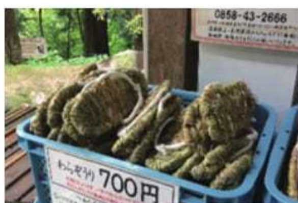
Waraji sandals are sold at the registration office.